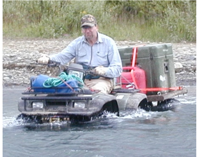
Crossing the Little Nelchina -- 2006