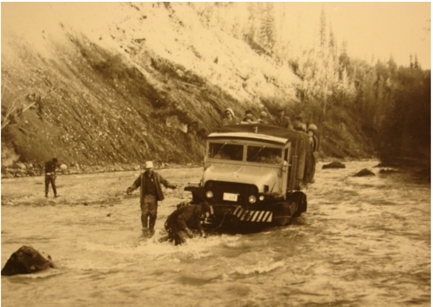
How they used to go rockhounding on the Little Nelchina – CGMS field trip, 1968

+==+==+==+==+==+==+==+==+==+==+==+==+==+==+==+==+==+==+==+==+==+==+==+==+==+==+