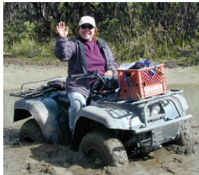
Stuck in a mudhole near the Little Nelchina -- 2003

During the November rock shows I have been a vendor for the last three years where I also took 1 st or 2 nd place ribbons in the display competitions.